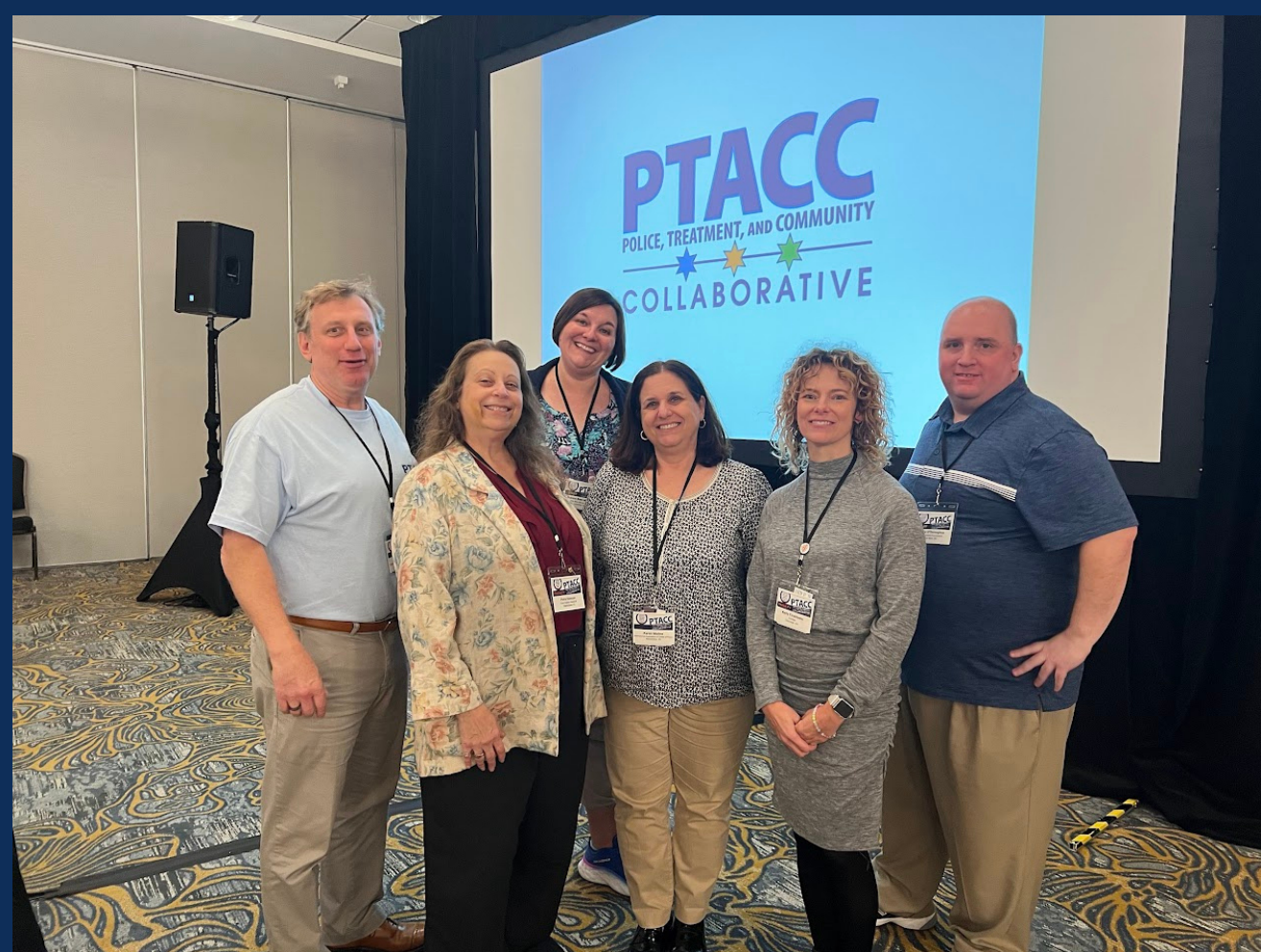
2023 PTACC TRAINING SUMMIT PLANNING TEAM!