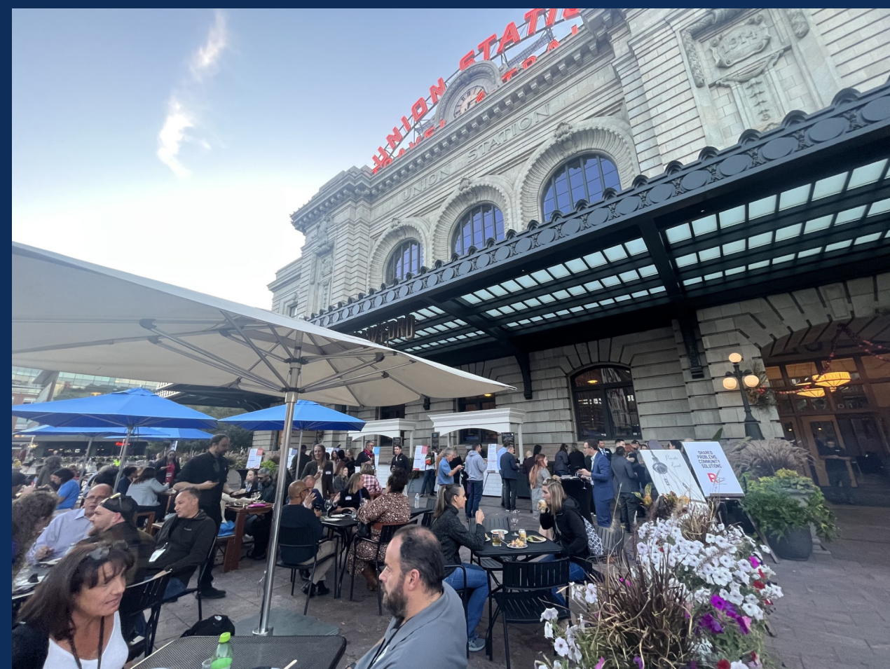
R St Reception Downtown Denver